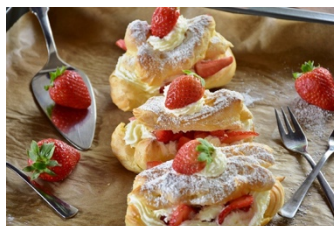
Eat bread and cakes