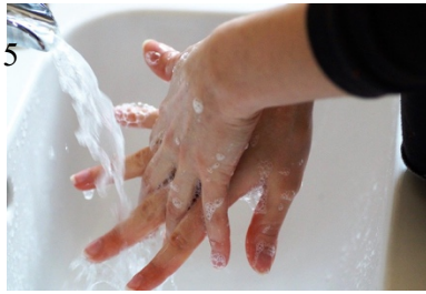
Wash your hands