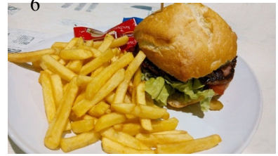
Eat fast food